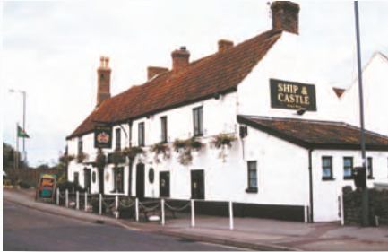
Ship & Castle Inn at Congresbury

Congresbury has always been an important village, being granted a weekly market and annual fair in 1227. The market cross still stands opposite the 'Ship and Castle'. There has been a stone church here since the early 8th Century. The Corporation of Bristol were Lords of the Manor at one time, hence the coat of arms 'Ship and Castle'.