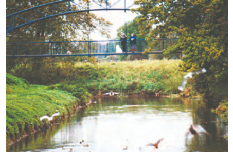
Millennium bridge over the River Yeo

Swans, ducks and herons live along the river and sometimes a kingfisher is seen. The weir is also popular with local anglers. The varied woodland on the hills to the north of Wrington Vale is seen at its best in the winter. It is easy to see why there was so much Roman settlement in this beautiful valley.