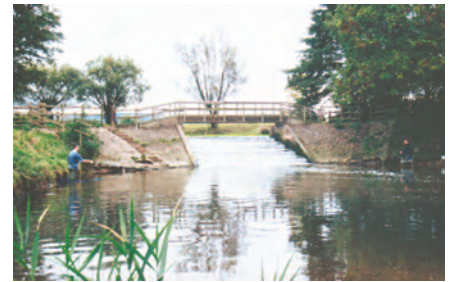
Weir on the River Yeo