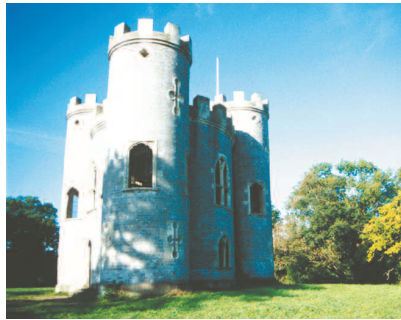
The Folly in Blaise Castle Estate

The landscape of Blaise has been changed by its inhabitants throughout its history. The area has been home to an Iron Age hillfort, a Roman temple and a medieval chapel on Castle Hill. The landscape seen today was designed by the famous landscape architect, Humphry Repton, creating what is seen as an oasis amidst Bristol's ever growing suburbs. As you walk along the top of Kings Weston Hill, consider that all these trees are a fairly recent addition to the landscape and that you could see for miles in most directions. No wonder a fort was built here!