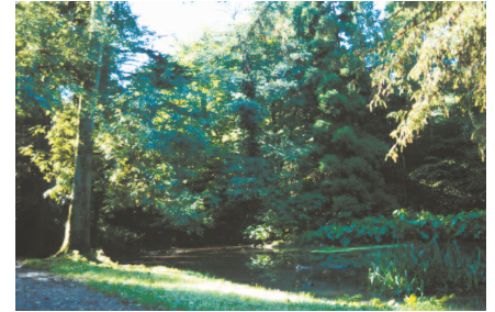
Penny Well Pool in Blaise Castle Estate

At Shirehampton the remains of the Lamplighter's Ferry to Pill are still visible. The name comes from the fashionable Regency Hotel, built by a street lighting contractor. The ferry was economically important until the M5 bridge opened. Shirehampton Railway Station was built to serve Pill rather than the genteel village of Shirehampton itself.