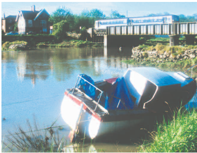
Severn Beach Railway Line across River Avon

Standing at the head of the harbour, looking through the rail and road bridges to the River Avon, it is difficult to imagine that this harbour dates back to the third century when it was part of the Roman settlement of Abona. The modern harbour was built in 1712, when it was one of only three in Britain where boats could remain afloat regardless of the tide. However, the distance from Bristol and lack of a good road link meant that Sea Mills was not popular with merchants and its use declined in favour of the city docks development. Today you can still see some remains of the harbour walls but the harbour itself is used only for mooring pleasure craft.