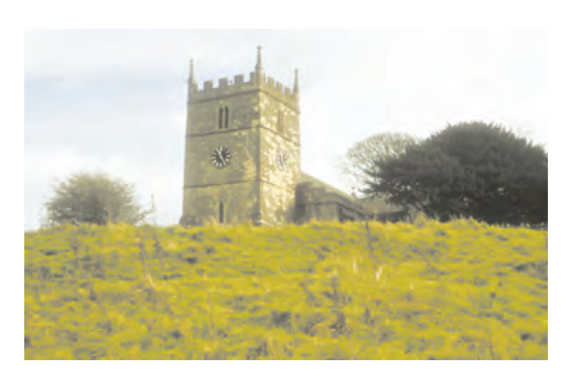
St John the Baptist Church

Dating to 1283, the original sections are the chancel arch and north chapel, dedicated to St Katherine, patron saint of weavers. The north aisle, Lady Chapel and south aisle were added in the 1400's, quickly followed by the 100ft tower. The six bells were cast in Gloucester in 1753 and were repaired and re-hung for the 700th anniversary celebrations in 1984.