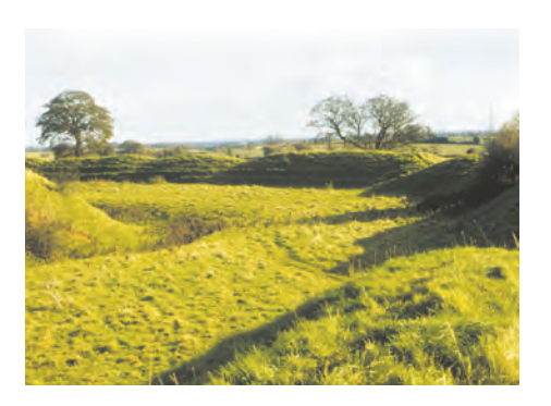
View of the Fort Area near Little Sodbury Wood